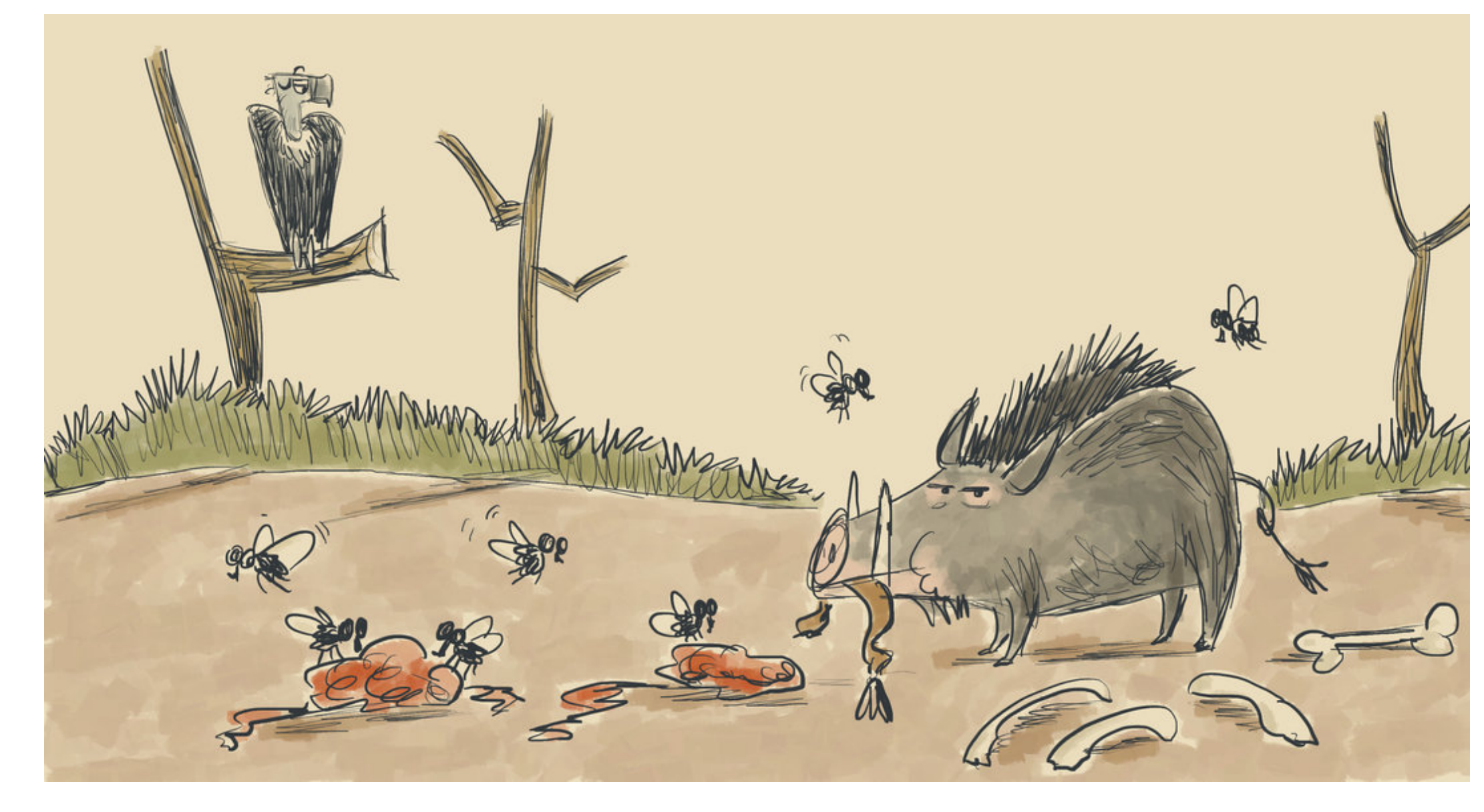
وَالْخِنْزِيرُ الْبَرِّيُّ الْجَائِعُ. خِرْرُ! خِرْرُ!