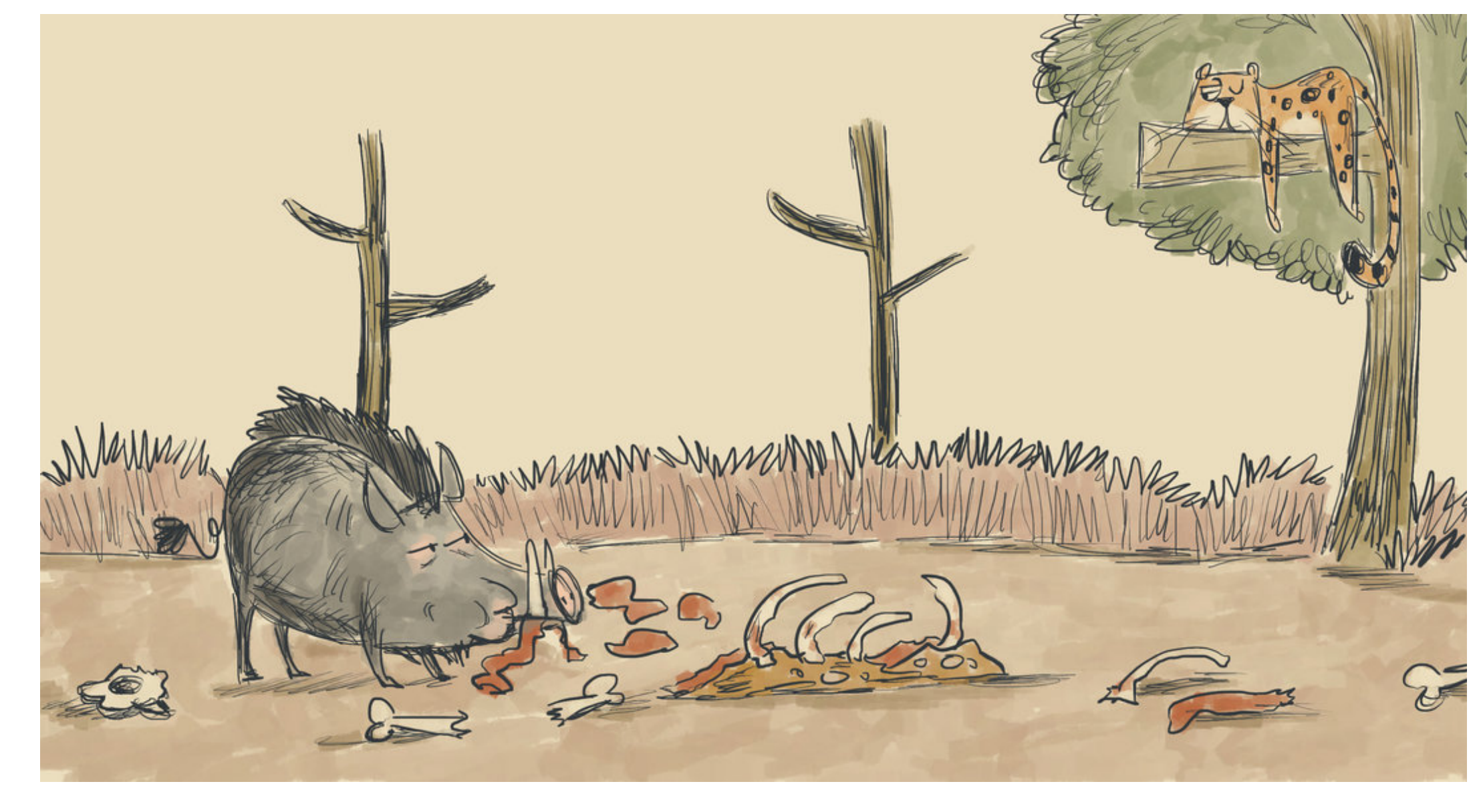
وَالْخِنْزِيرُ الْبَرِّيُّ الْجَائِعُ. خِرْرُ! خِرْرُ!