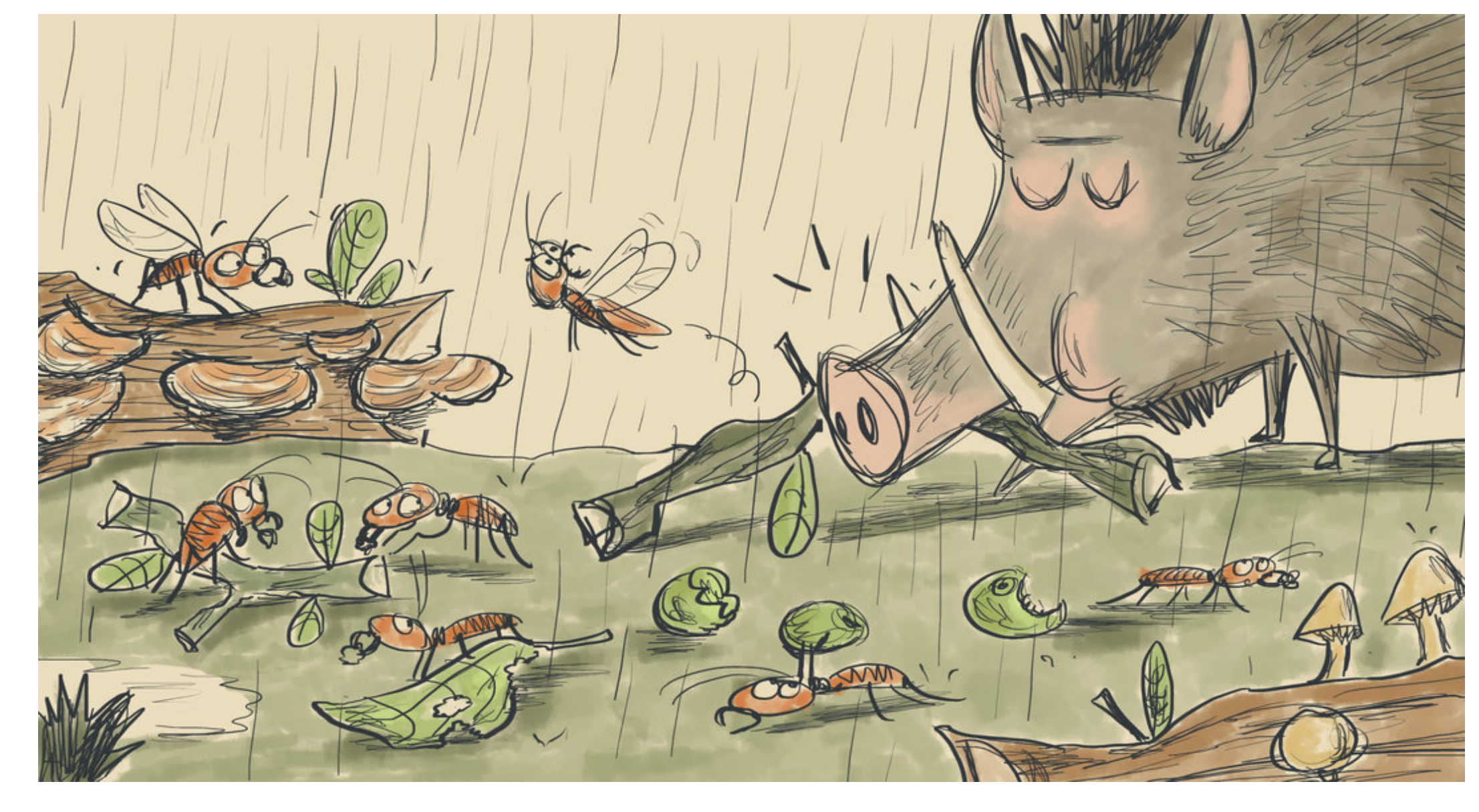
وَالْخِنْزِيرُ الْبَرِّيُّ الْجَائِعُ. خِرْرْ! خِرْرْ!