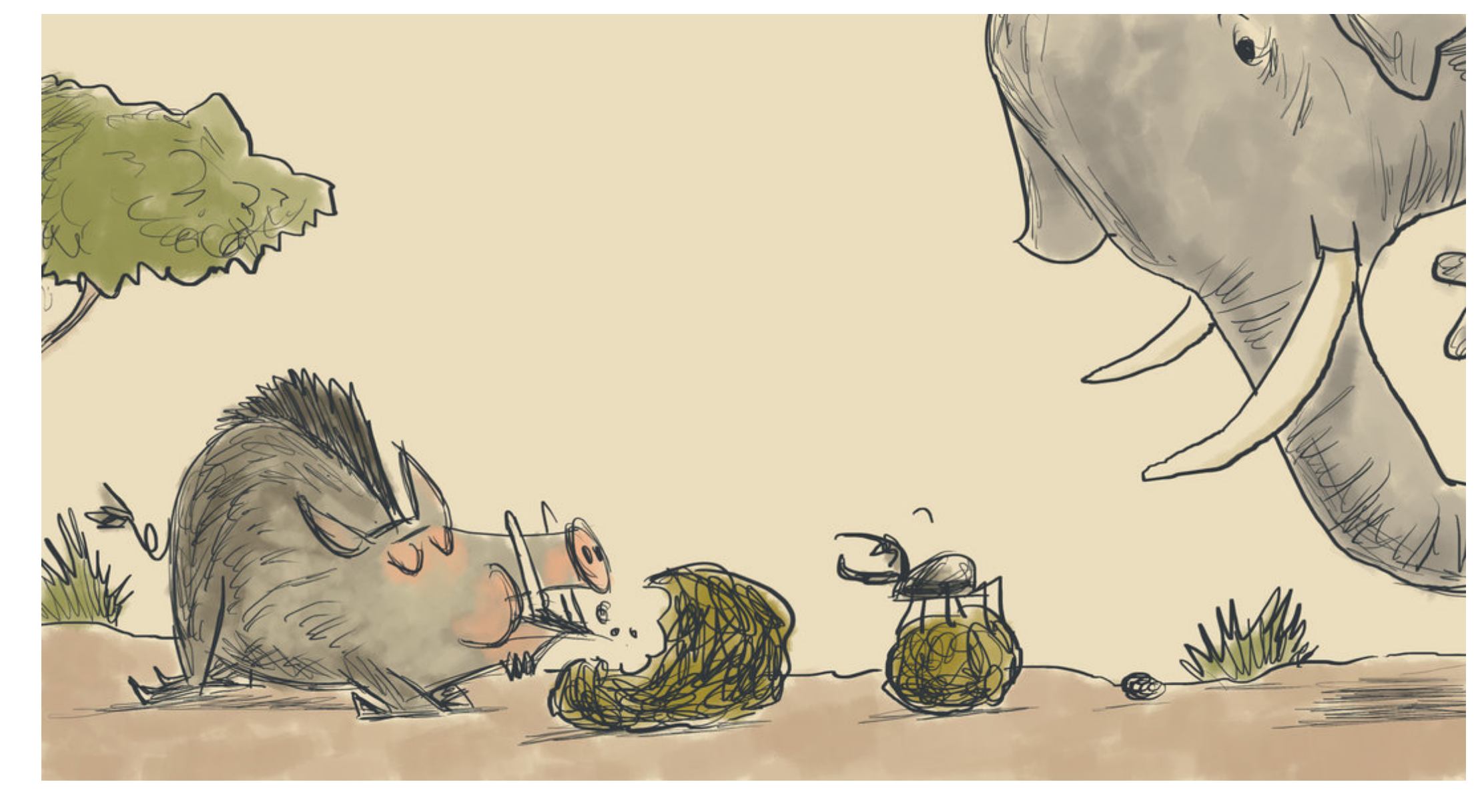
وَالْخِنْزِيرُ الْبَرِّيُّ الْجَائِعُ. خِرْرُ! خِرْرُ!