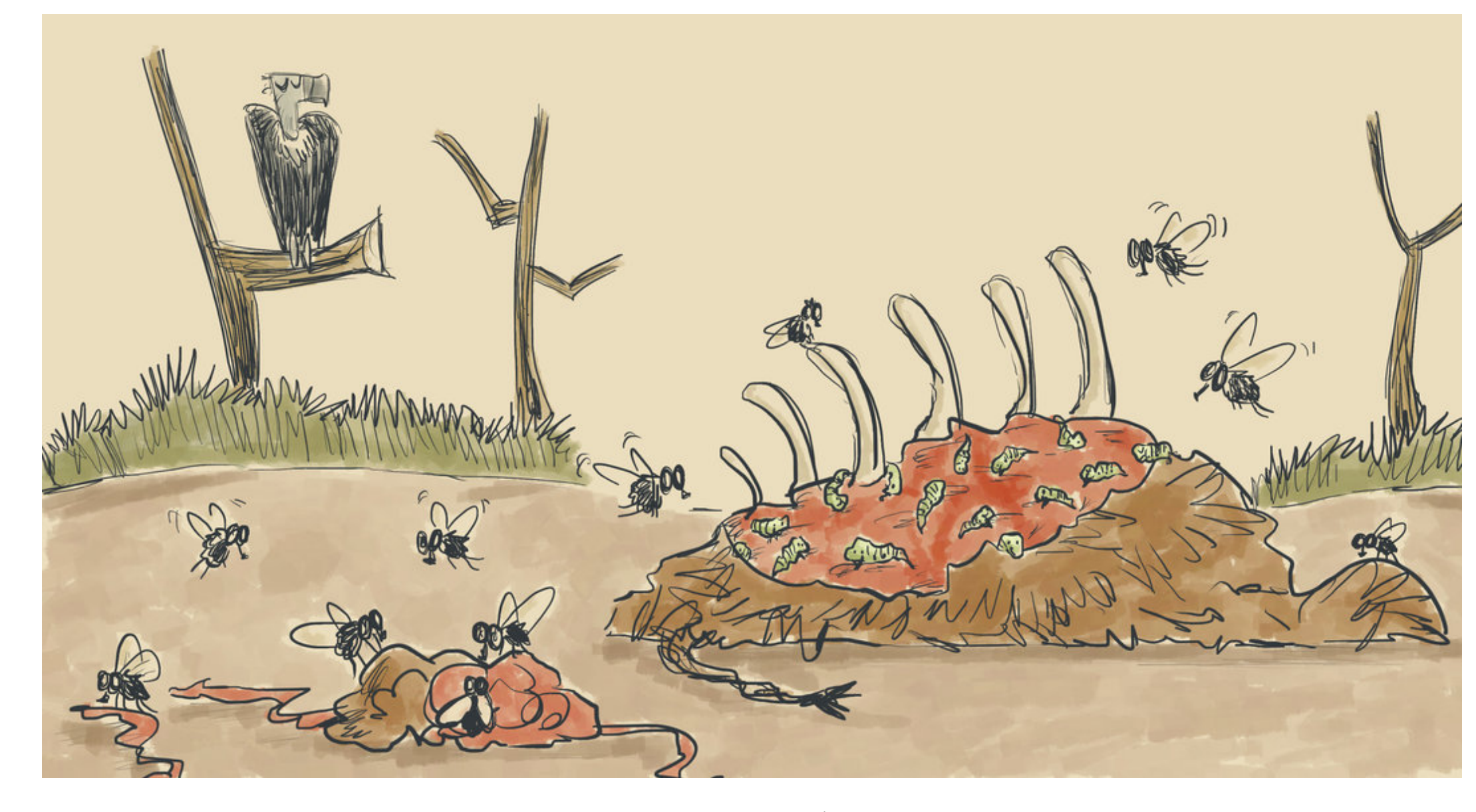
عِنْدَمَا تَتْرُكُ النُّسُورُ وَالضِّبَاعُ طَعَامًا خَلْفَهَا، مَنْ يَلْتَهِمُهُ؟ الذُّبَابُ وَالدِّيدَانُ!