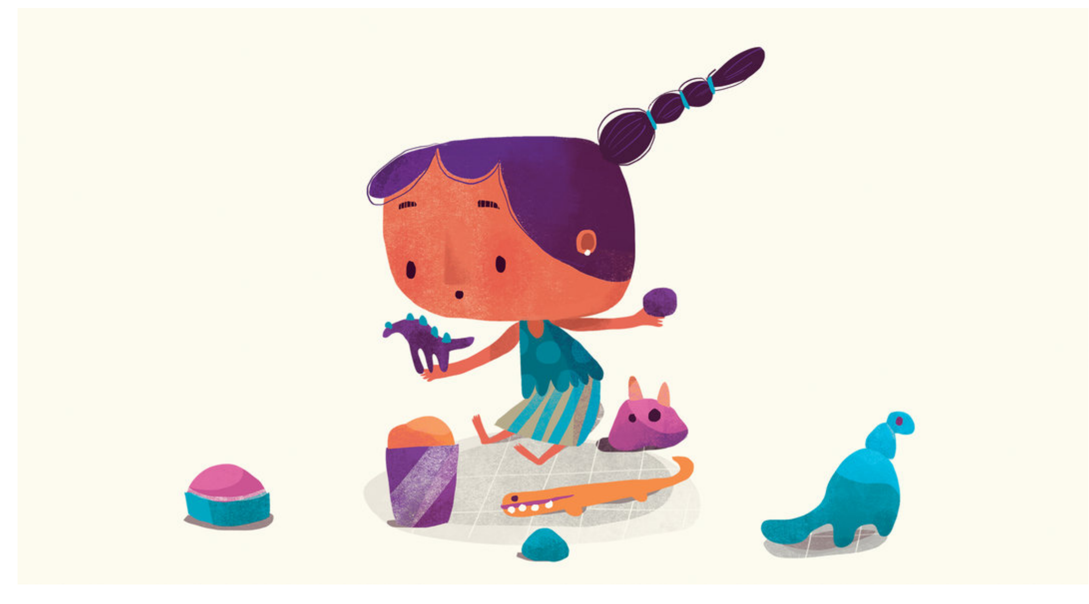
الْيَوْمَ أَنَا نَحَّاتَةٌ.