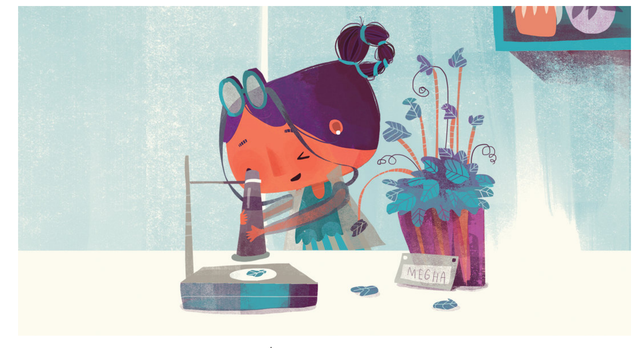
لَقَدِ اكْتَشَفْتُ نَبْتَةً جَدِيدَةً، وَسَأْسَمِّيهَا بِاسْمِي.